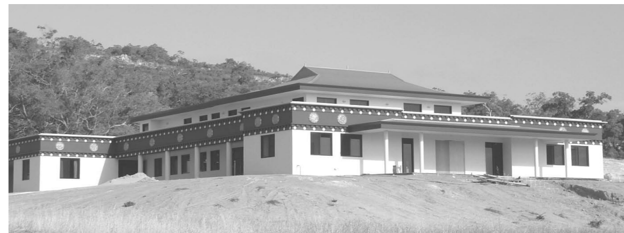
The traditional Tibetan temple is nearing completion.

Construction of our temple is nearly complete – there remains only finishing touches to the inside, and the erection of the roof ornaments.